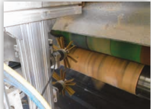
Trim Removal System installed on a Flexo-Folder-Gluer