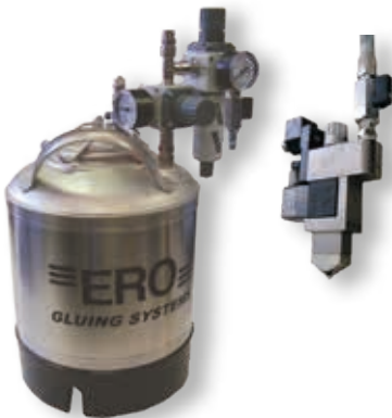
Marking Valve and Tank

An extractor, kicker and marker for defective boxes are available as optional complementS. Both touch screen and iPad come standard with the software to drive the devices. When the predefined limit of faulty boxes has been registered, the system automatically shuts down the feeder.