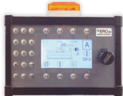
Standard Control Panel

*The size includes lamp, knob and control panel support.